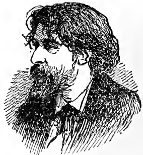
ALPHONSE DAUDET In 1895.